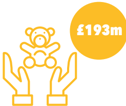
Child protection and other children's services