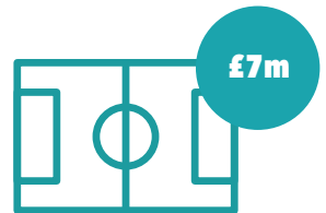
Community sport and events