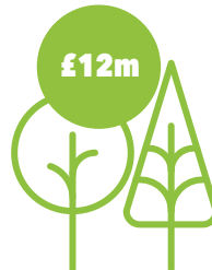
Parks and nature conservation