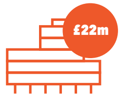
Library of Birmingham and community libraries