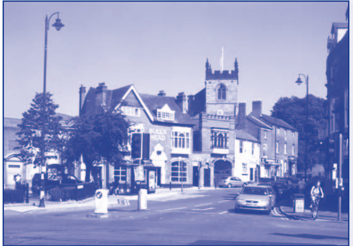
Moseley Village:- The Green

After extensive public consultation the City Council recently approved a Character Appraisal and Management Plan for the Moseley Conservation Area. It was originally designated a conservation area in 1983, was extended in March 2005 and an Article 4(2) Direction was introduced on 13th May 2005 in parts of the area and your property is included within that Direction.