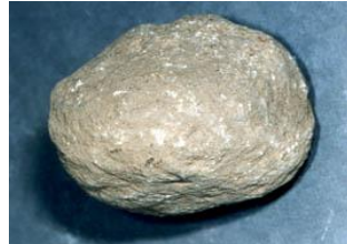
A small grey stone