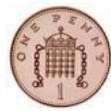
A Penny (1p coin)