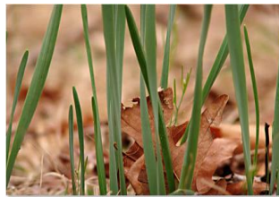
A Blade of grass