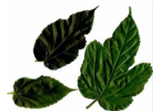
3 Different leaves