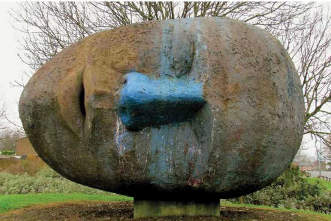
Ondre Nowakowski Sleeping Giant 1992