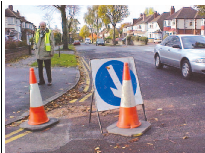
Fig. 3: Lay Assessor inspecting streetworks in Perry Barr Ward