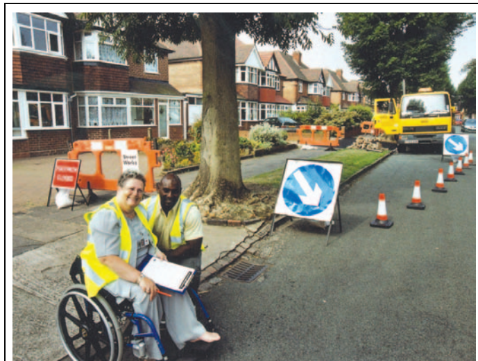
Fig. 2: One of the Council's Lay assessors on site