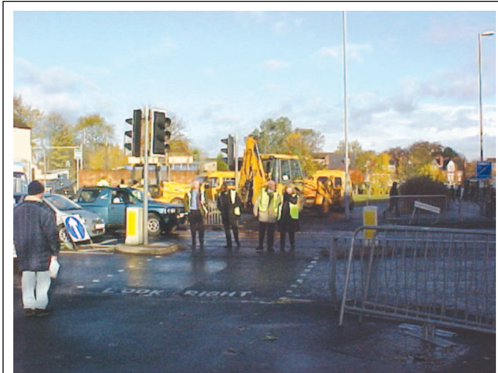
Fig. 1: Members of the review panel inspecting traffic management arrangements, Heathfield Road, Handsworth