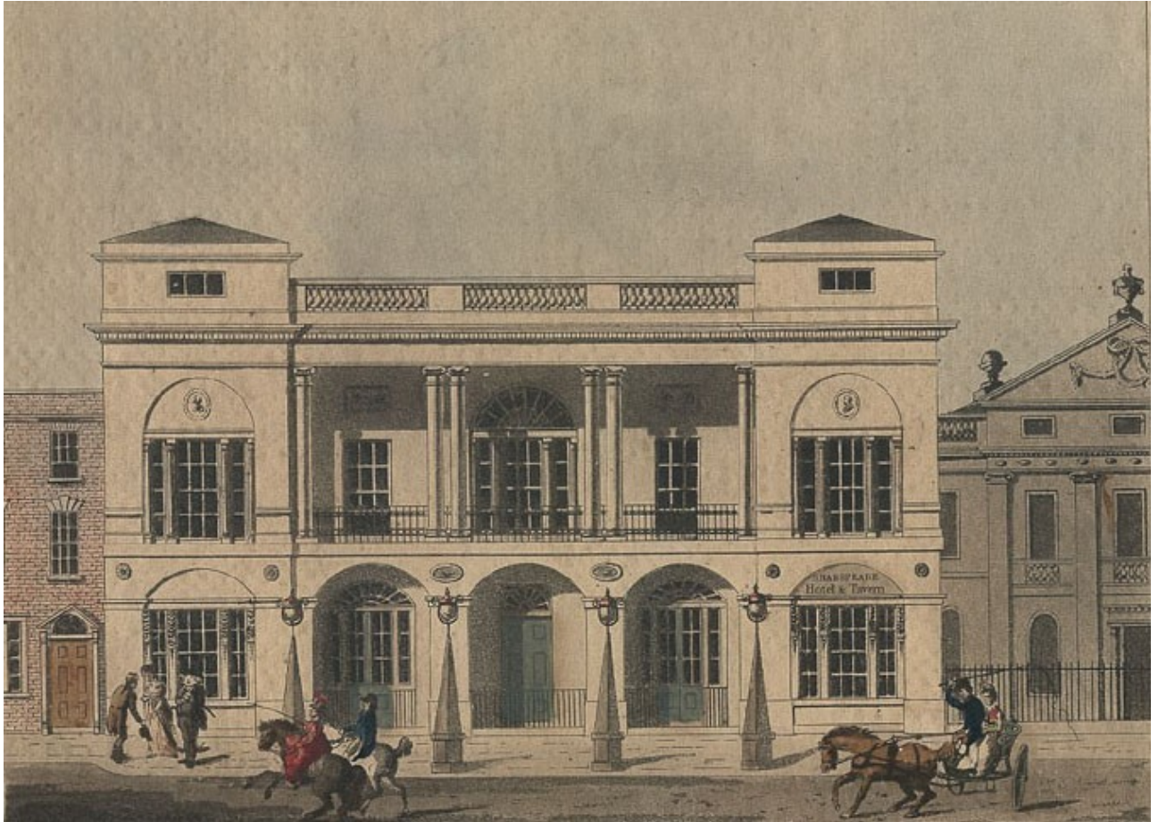
Image of the New Street Theatre, with the Shakespeare Tavern clearly marked on the right-hand side of the building.

The story of Birmingham's relationship with Shakespeare in performance goes back a long way and has always had the precedent of making theatre accessible across class divisions. Going to see a Shakespeare play was not the expensive event that it is now. Shakespeare productions in the Victorian period were truly public entertainment outside any divisive cultural, educational or class ownership. With theatre one of the main sources of entertainment, theatre managers had to keep their prices low, and create bills of entertainment that would draw in crowds; Shakespeare was definitely one of those draws.