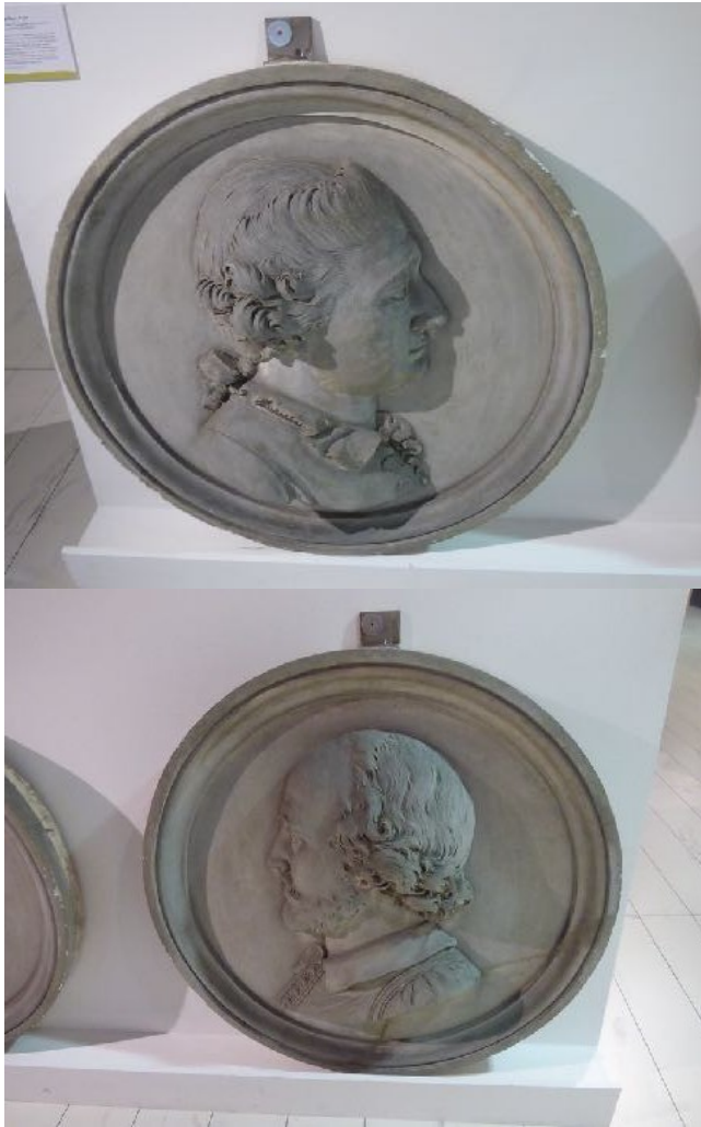
Stone reliefs of Garrick and Shakespeare, the only surviving pieces of the New Street Theatre Royal. Held in the Shakespeare Collection.