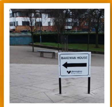
New signage for Bakeman House