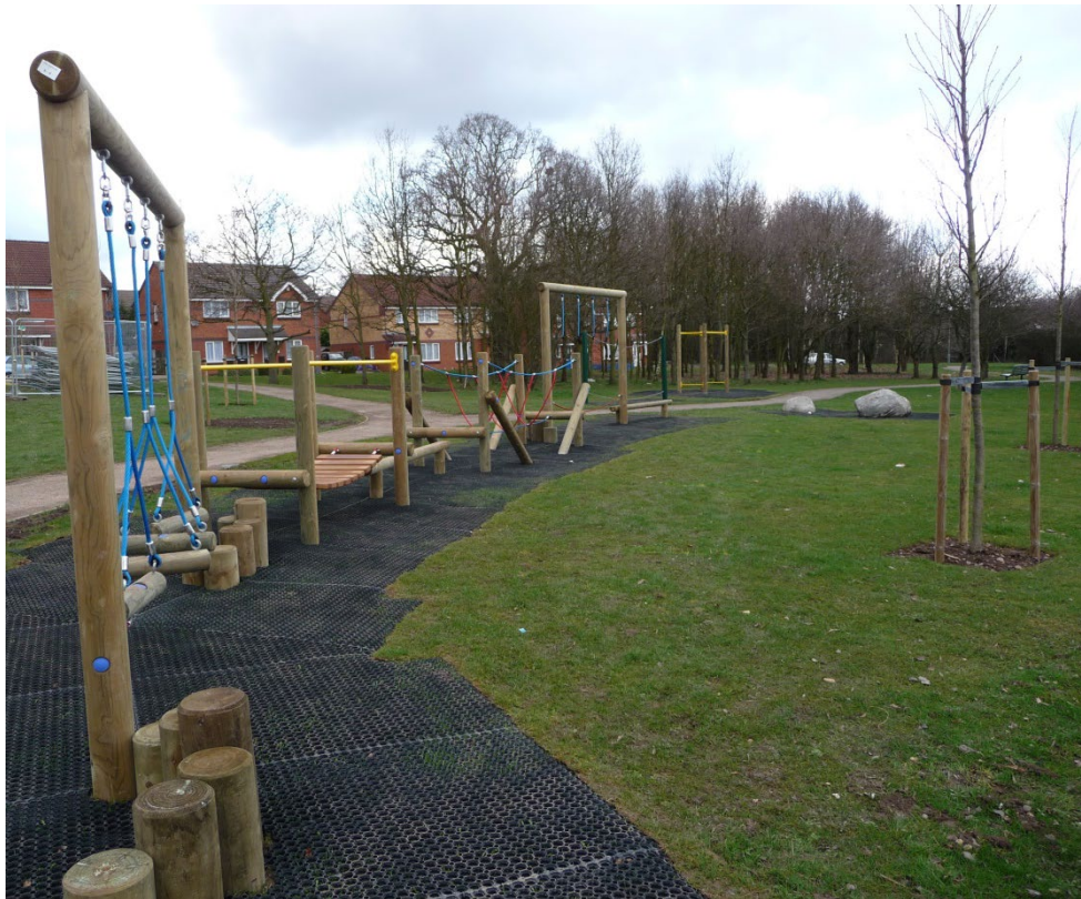
Berryfields, Sutton Coldfield

Surfacing: although the low fall height suggests no safety surfacing would be required under this equipment, inevitably the surrounding surface will erode with regular public use. To overcome this, BCC recommends the installation of either a sand-filled needle punch carpet system with impact absorption matting or grass grid matting with fire retardant properties, around the trim-trail equipment. To avoid hollows forming beneath the equipment it must be on a solid surface with no loose chippings.