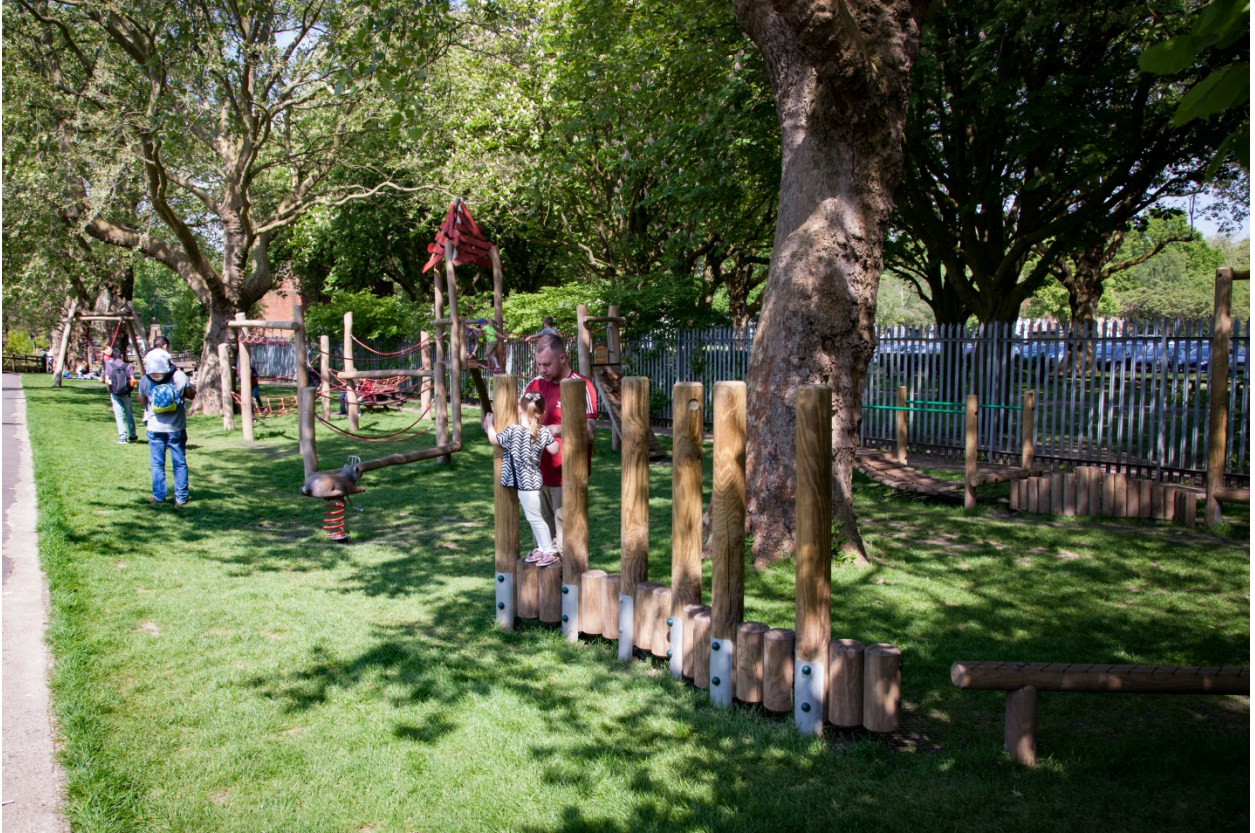
Birmingham Wildlife Conservation Park