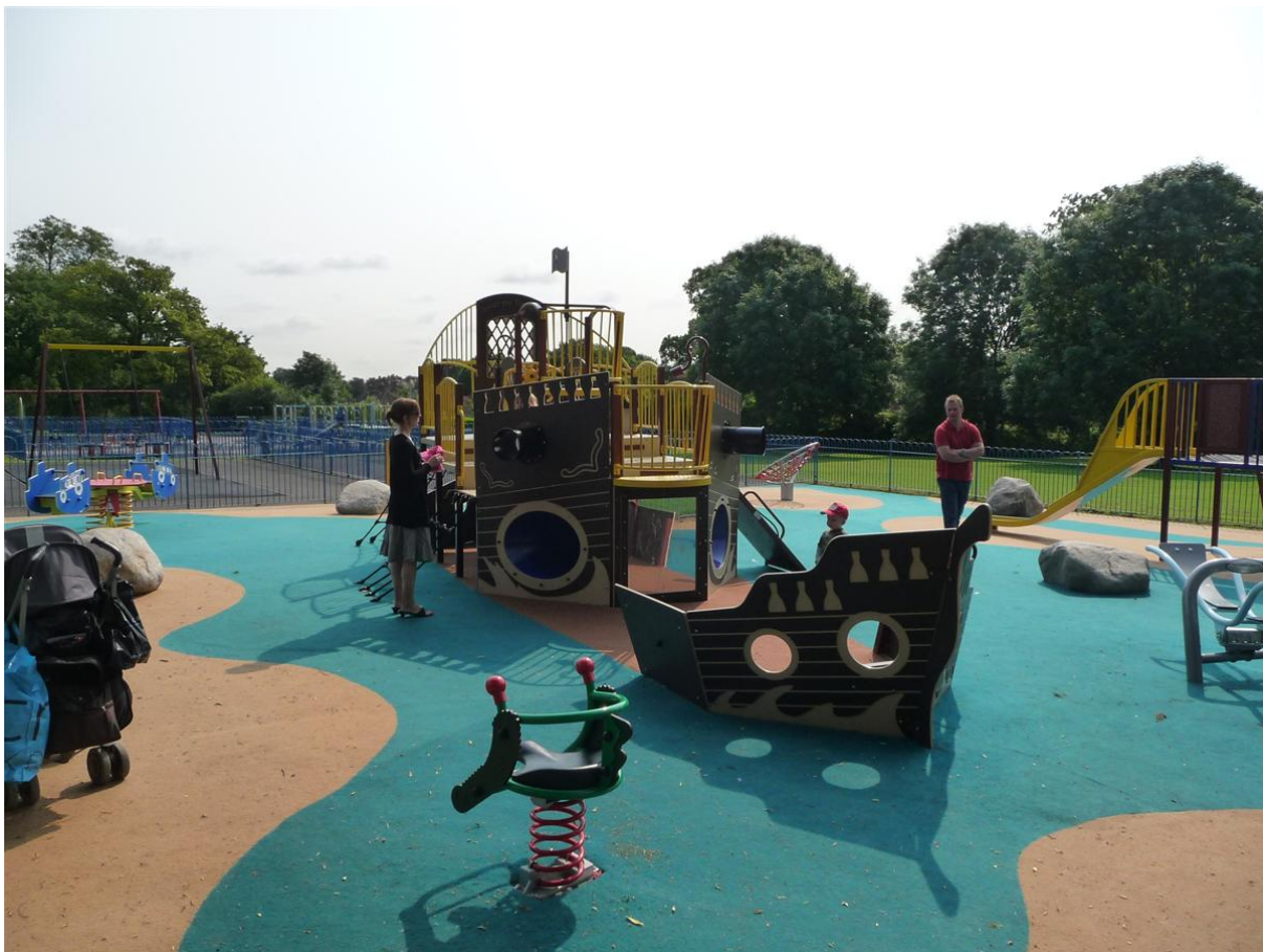
Victoria Common, Northfield

Special provision for severely disabled children may be appropriate in some locations; for example where there is supervision near a play centre or special school. The play area location and design in some instances may therefore be affected by its relationship to these centres. Clear vehicular access adjacent to the play area should also be considered. The provision and maintenance of specialist swings, lifts etc. for children and adults who have a disability are outside the remit of the Parks Service Outdoor Play Facilities Policy. However it is recognized that supervised play centres or special schools and day centres may be able to provide such facilities. It is therefore desirable that these specialist providers where they exist are signposted through the Parks Service's communications.