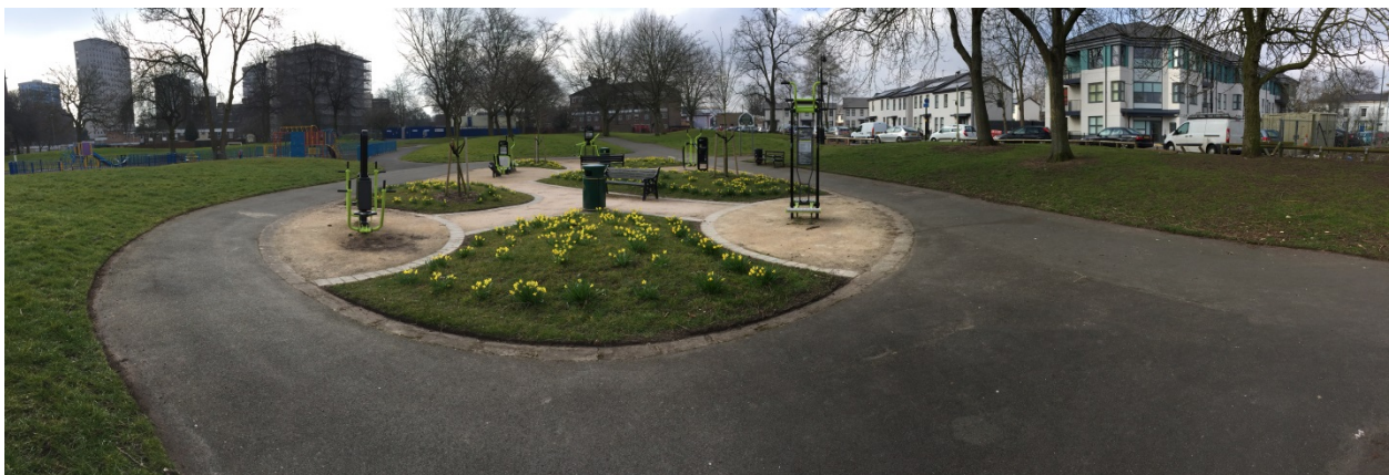
Chamberlain Gardens, Ladywood