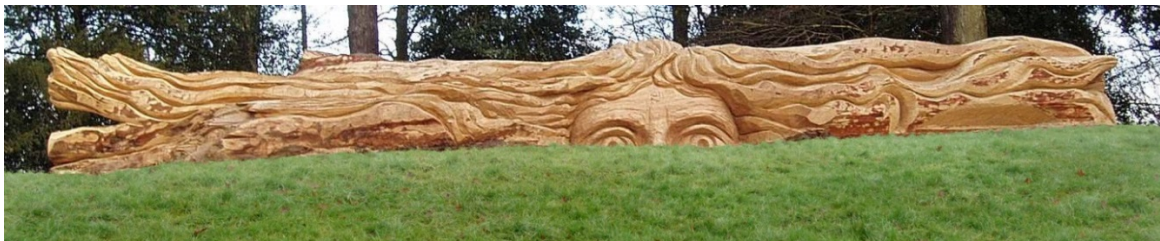
Ley Hill Park , Northfield