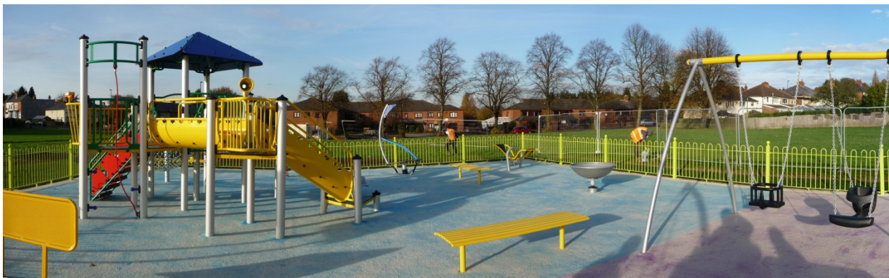
Arrow Walk Park, Kings Norton