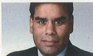
Khalid Mahmood MP

The Member of Parliament for Perry Barr Constituency within which Handsworth Ward is situated is Mr Khalid Mahmood.