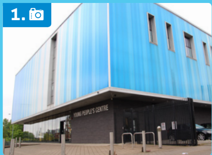
The Lighthouse Young People's Centre

Aston University – received its royal charter from Queen Elizabeth II in 1966, after starting life as Birmingham Technical College in 1895.