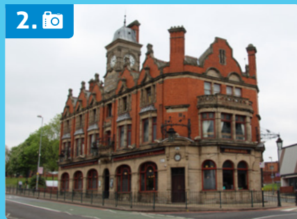
The Bartons Arms Public House