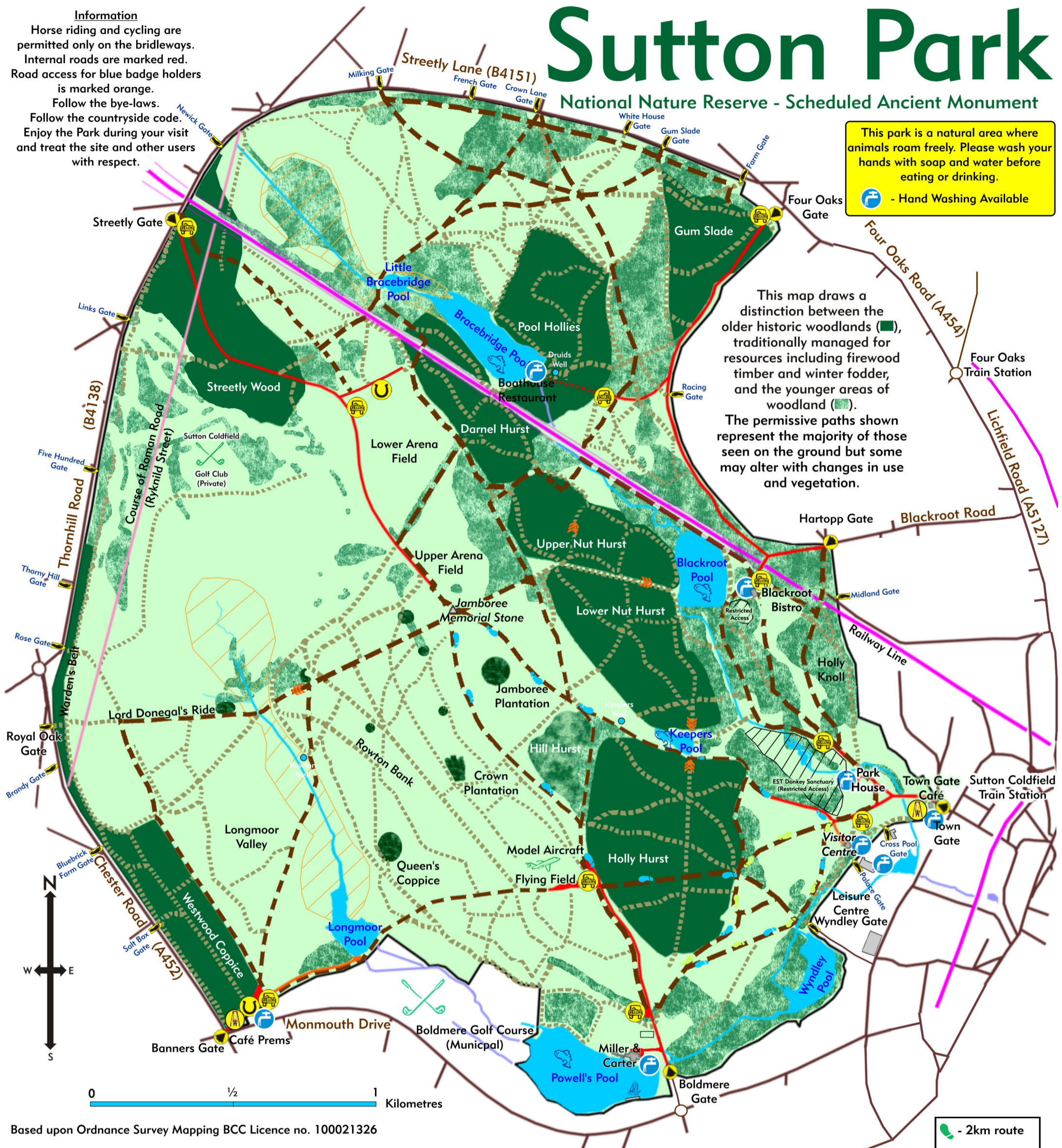
Based upon Ordnance Survey Mapping BCC Licence no. 100021326

This map draws a distinction between the older historic woodlands (dark green), traditionally managed for resources including firewood timber and winter fodder, and the younger areas of woodland (light green). The permissive paths shown represent the majority of those seen on the ground but some may alter with changes in use and vegetation.