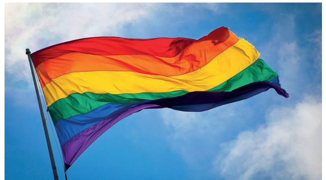
The Rainbow flag