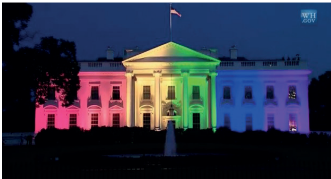
The White House in rainbow colours

Look at the below images. What do you think they represent?