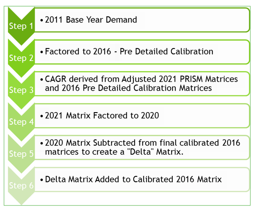
Figure 1.2: Modelled Years Adjustments Process